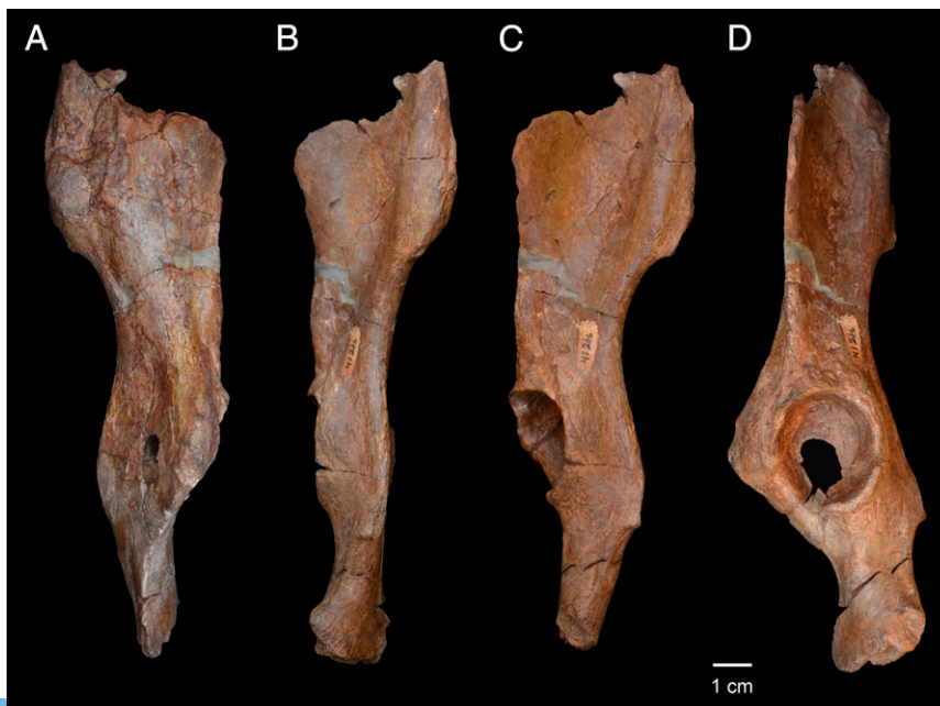
Fig. 1. Ventromedial (A), dorsal (B), dorsolateral (C), and lateral (D) views of YGSP 41216, a partial left innominate.

Sivapithecus is most similar to atelines in general (Fig. 2) and to Lagothrix in particular (Table S1). Proconsul , an African early Miocene probable stem hominoid, is closest to Sivapithecus , and then equally to Lagothrix and some cercopithecoid monkey species by Euclidean distance, but clusters with the cercopithecoid individuals lying closest to the atelines in the principal components